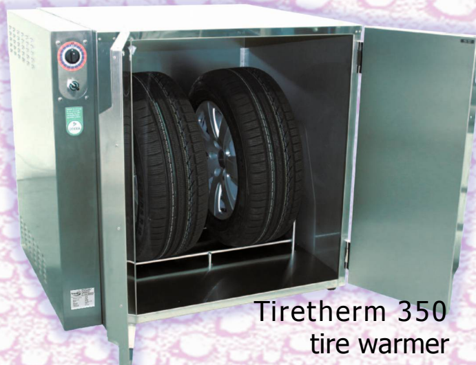
Tiretherm 350 tire warmer

More products of our manufacturing program